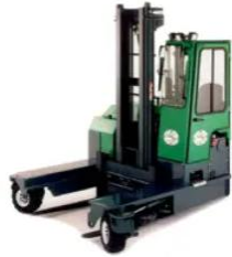
COMBiLIFT LIFTING INNOVATION