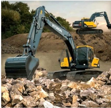
HD HYUNDAI CONSTRUCTION EQUIPMENT